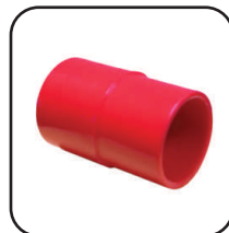
Pipe to Detector Adapter Part #RP5207 = each

Part #RP5209 = 8' Length Part #RP5209-15 = 15' Length