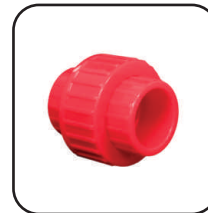
3/4" (27mm) ABS Union

Part #RP5205 = each Part #RP5205X = 10 pack