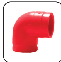
3/4" 90° ELBOW

Part #RP5203 = each Part #RP5203X = 10 pack