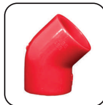
3/4" 45° ELBOW

Part #RP5203 = each Part #RP5203X = 10 pack