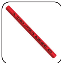
RedPipe 3/4" Smoke Detection

Part #RP5209 = 8' Length Part #RP5209-15 = 15' Length