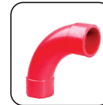
3/4" 90° Low Profile Radius Bend

Part #RP5230 = each Part #RP5230X = 10 pack