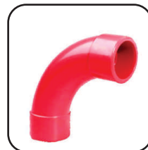
3/4" 90° Radius Bend

Part #RP5202 = each Part #RP5202X = 10 pack